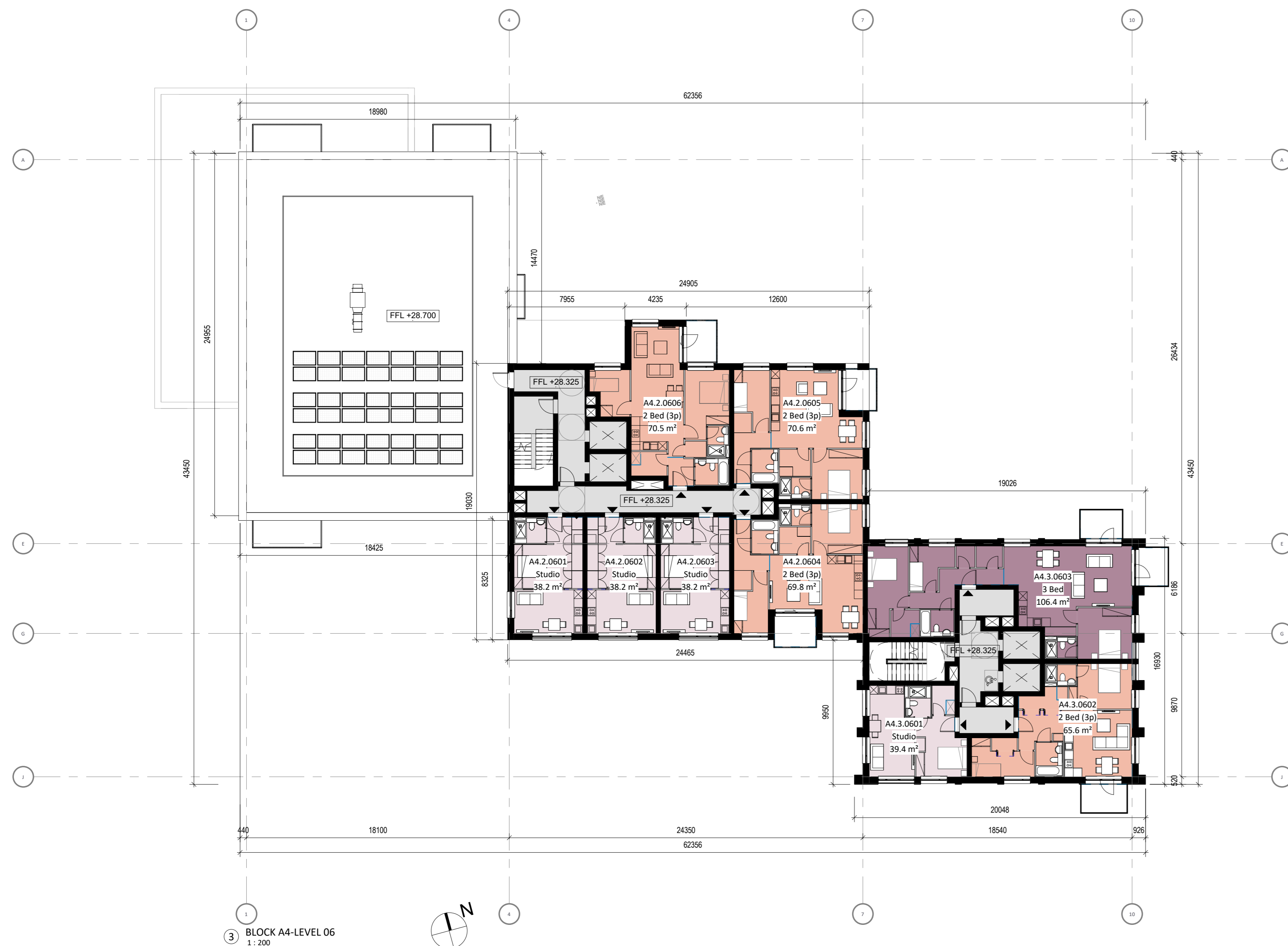
3 BLOCK A4-LEVEL 06 1:200